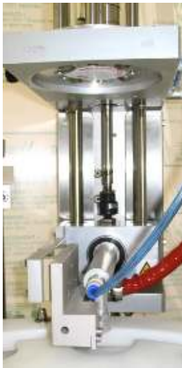
application of foil disks with vacuum dispenser and pre-sealing