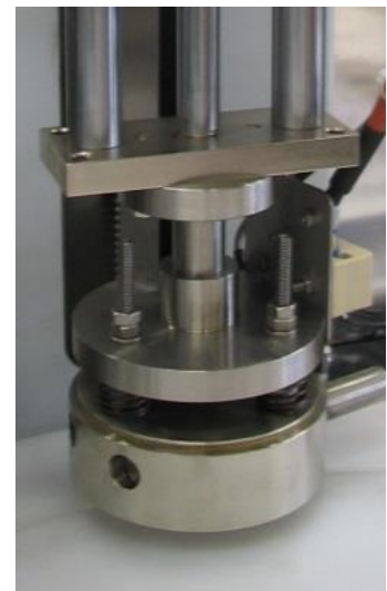
hot sealing station