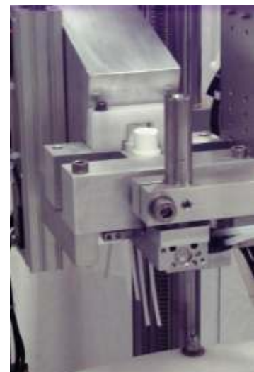
applicator for spray pumps incl. tensioning the tube