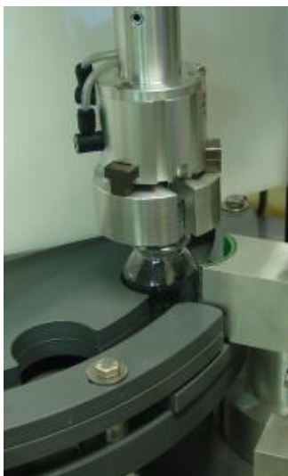
gripper style capping head for secure capping